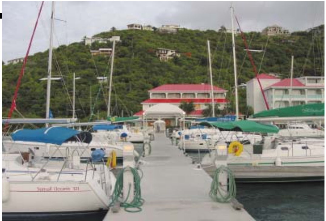
View of Mood Indigo docked at The Bitter End Yacht Club, Virgin Gorda

Day 4: Rest day at The Bitter End; hike to Biras Creek; famous