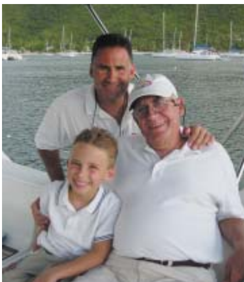
3 Generations...1 Sailboat

well as many other amenities not commonly found in other charter sailboats.